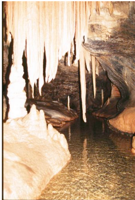
The Streamway Passage of Croesus Cave. Mole Ck, Tasmania.

There was much groaning, thoughts of washing hair, mowing the lawn etc.