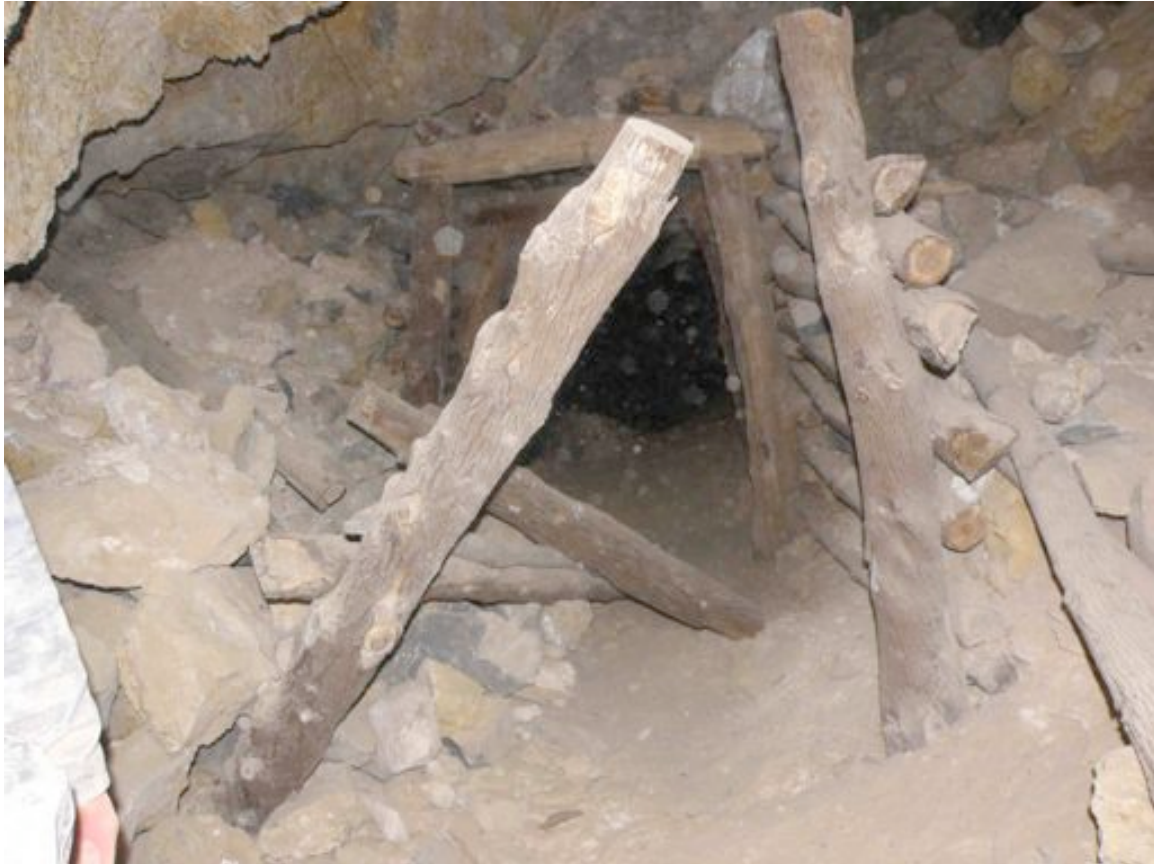
The Rock and Stanchion Collapse in Clara St Dora

There was a collapse of some stanchions in Clara St Dora cave last weekend when one of our party lent on one of them. Some discussions are occurring between FUSSI and CEGSA as to what to do about it. The collapse has partly obstructed the track into the cave near the gate. Further, the gate itself has been actively bypassed by some enterprising bodies. FUSSI members will be returning to the area with a couple of bags of cement to plug the bypass and no doubt move a few of the rocks out of the way from the collapse! The entrance to Clara St